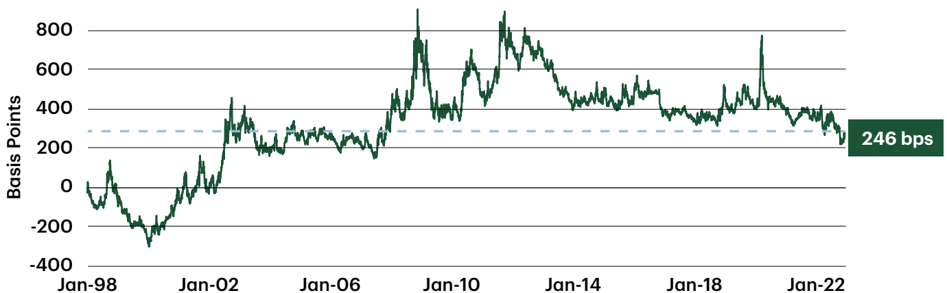
Earnings Yield - 10Y Treasury Yield (1998 - 2022)

Source: TD Asset Management Inc. (“TDAM”), Bloomberg Finance L.P., as of December 15, 2022.